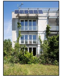
The world's first Passive House building in Darmstadt, Germany celebrates its 30th anniversary in 2021!