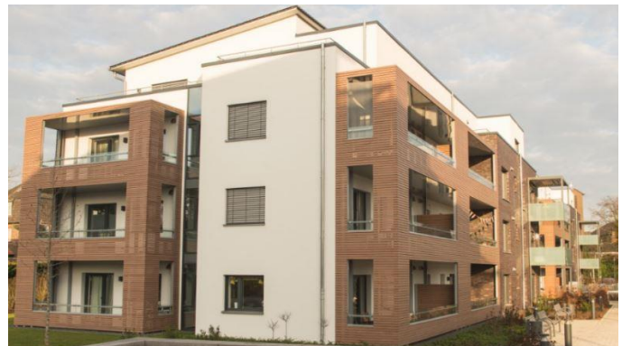
Projects at #25intPHC: A students' hostel in Vienna, Austria (above) and climate-friendly housing settlement in Kleve (Germany): Passive house buildings require very little energy for heating and cooling and thus effectively protect the climate.