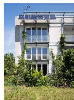
The world's first Passive House building in Darmstadt-Kranichstein.