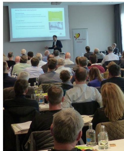
Social housing was the main topic at the 55th Session of the Research Group for Cost-effective Passive Houses.