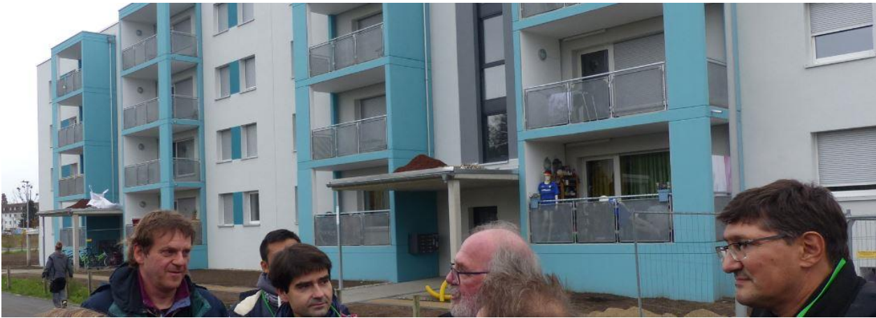
Social housing to the Passive House standard: the incidental costs for the PassivhausSozialPlus in Darmstadt aim for two Euros per square metre, including the budget for electricity and hot water, greywater utilisation and internet. The Research Group for cost-effective Passive Houses and the subsequent excursion during the Open Days focused on this nationwide model project.