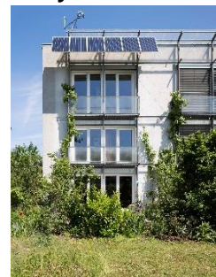
The world's first Passive House building in Darmstadt-Kranichstein.