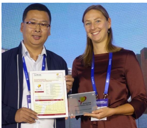
At the Conference, the Passive House Institute also presented certificates for Passive Houses.

EcoCocons, Slovakia/Lithuania, for its construction system consisting of straw, Q-Blue, Netherlands, for its shower-water heat recovery system, Swisspacer, Switzerland, for the new window spacer concept Triple, and Windowor City, China, for a wooden window concept with an aluminium shell which is adaptable to all climate zones.