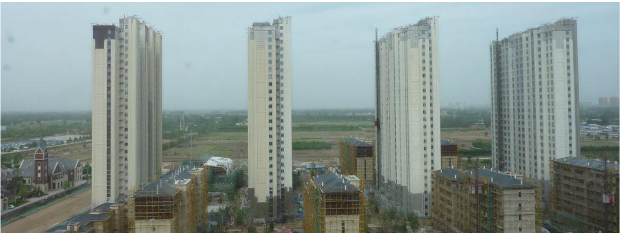
The construction site from a different perspective. After completion, the Bahnstadt Gaobeidian will be the largest Passive House settlement in the world. The apartments can be viewed during the Passive House Conference.