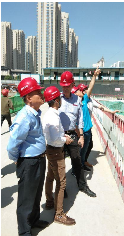
Passive House Institute staff members visit the Passive House construction site in the town of Taiyuan. The Conference in October will have the motto "Passive House worldwide" and will showcase projects from around the globe.

A series of more than 20 lectures will take place on 9 and 10 October 2019 (Wednesday and Thursday). Two of these presentations will deal with interesting residential as well as non-residential Passive House projects in China. Two series of presentations will discuss energy efficient retrofits, including projects in Sri Lanka, Australia, the USA, Austria, Italy, Norway and Romania. Another working group will examine Passive House projects in hot climates requiring active cooling.