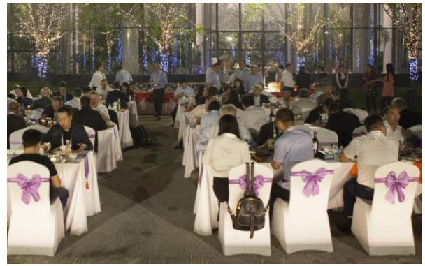
The exhibition hall in Gaobeidian, in which the 23rd International Passive House Conference will take place from 9 - 11 October 2019. The organisers will also host an evening event on the premises.