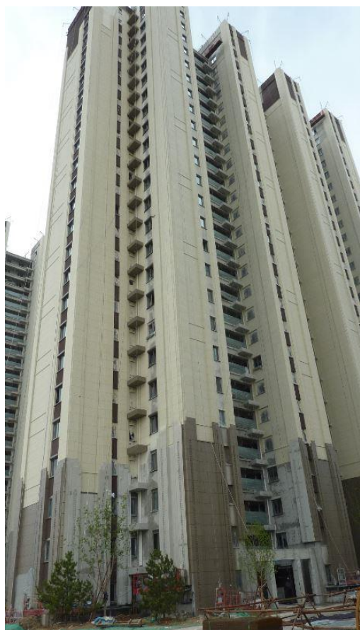
20 high-rise buildings and several multi-family houses are being built to the Passive House Standard in the Bahnstadt Gaobeidian.