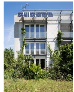
The world's first Passive House in Darmstadt-Kranichstein.