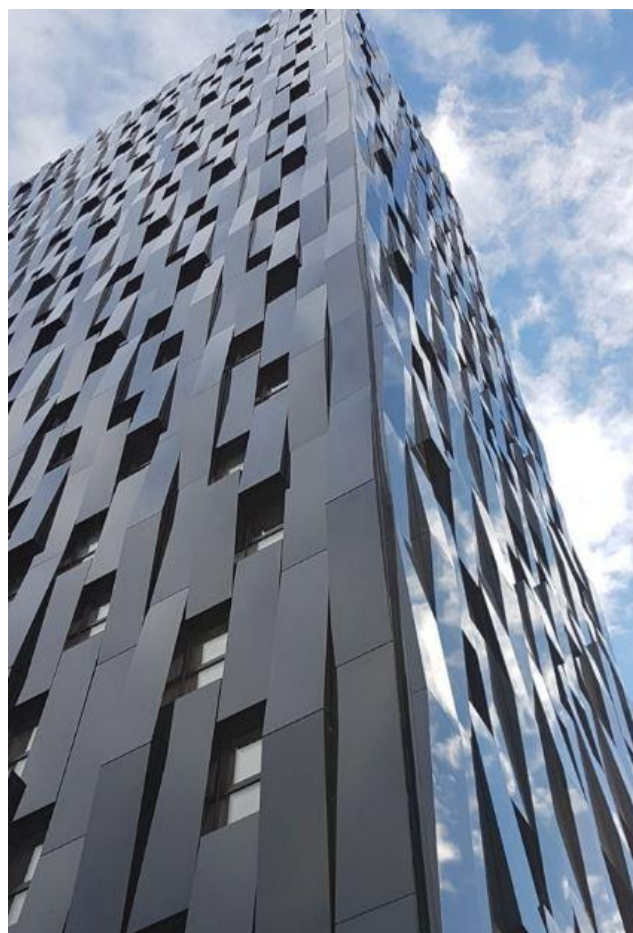
The 88-metre tall Bolueta in Bilbao, Spain, is currently the tallest Passive House high-rise worldwide. © VArquitectos

The challenge was to keep within the budget and use traditional materials, the architect explained. "Now that Bolueta is complete, there are no excuses anymore: it is possible to realise such a project in Bolueta, and it is just as possible to realise one almost anywhere out there," says Velázquez.