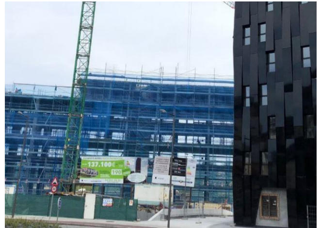
Another Passive House high-rise building with 190 apartments is being built directly next to Bolueta in Bilbao. © VArquitectos

Among the first Passive House high-rise buildings are a 16-storey building in Bugginger Strasse in Freiburg retrofitted to the Passive House Standard in 2011, and the Raiffeisen Tower in Vienna. The latter was built on the premises of the former OPEC headquarters and started operations in 2013. The 78 metre tall building provides space for about 900 offices. In Spain, the Basque Government is constructing another Passive House high-rise right next to Bolueta. Although this will be smaller with 21 storeys, it will be more extensive than the first building and will have 190 apartments in total. Ten storeys of the second building, which will also be certified, have already been completed.