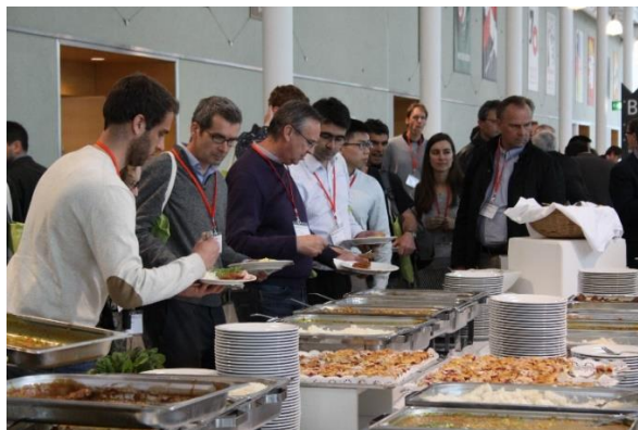
'Passive House for All' was the focus of the 21st Passive House Conference in Vienna.