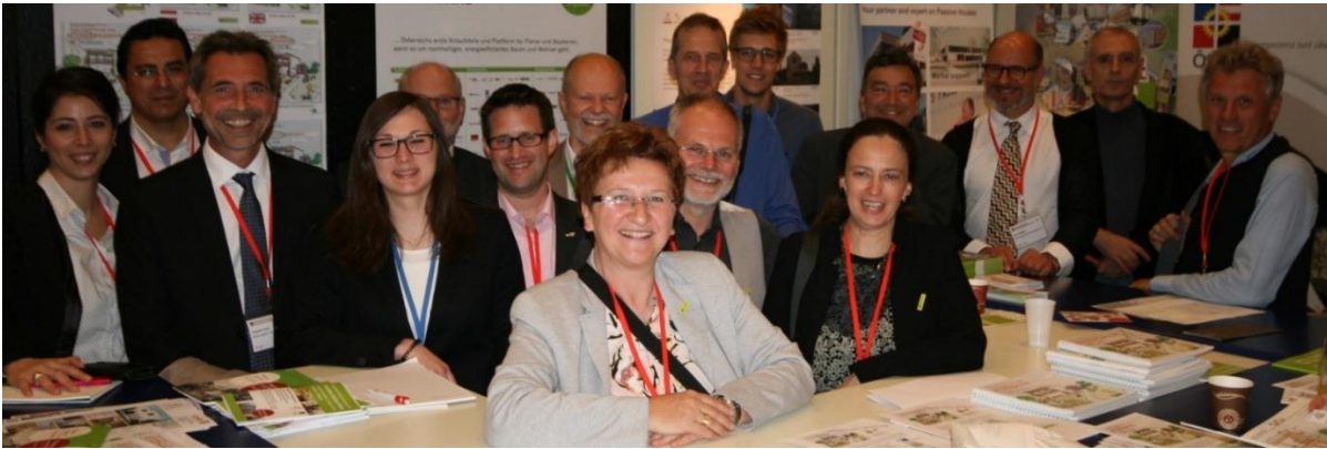
The Passivhaus Institute, together with Passivhaus Austria (picture), invited participants to Vienna.