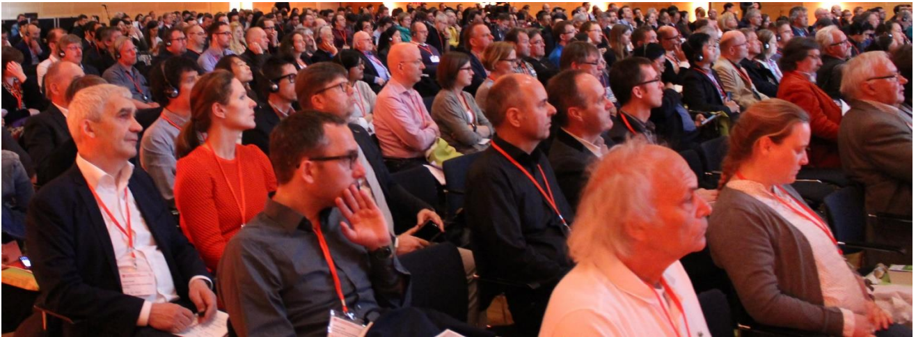
Full plenum at the 21st International Passive House Conference in Vienna: Changing habits and allocating resources fairly is necessary to reduce climate change, explained the renowned climate researcher Helga Kromp-Kolb. This also applies to the construction sector.