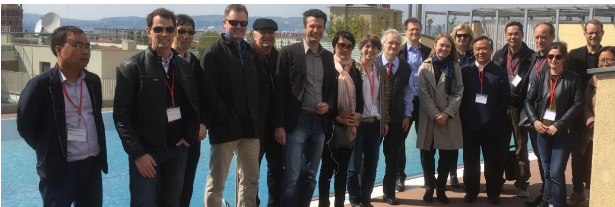
Excursion to the Passive House multi-family complex in Vienna's Raxstraße with a pool on the roof. © PHI