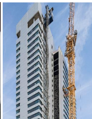
Three Passive House presentations (f.l.t.r.): Passive House Temple Tochoji in Tokyo, mobile Passive House from the 3D printer and Passive House high-rise Cornell Tech in New York.